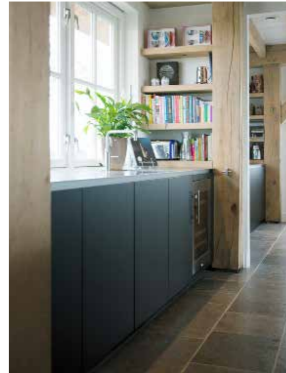
+SEGMENTO Kapel-Avezath, Netherlands