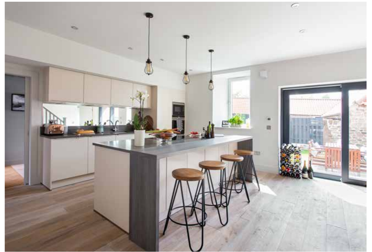
PREMIUM COLLECTION North Berwick, Scotland