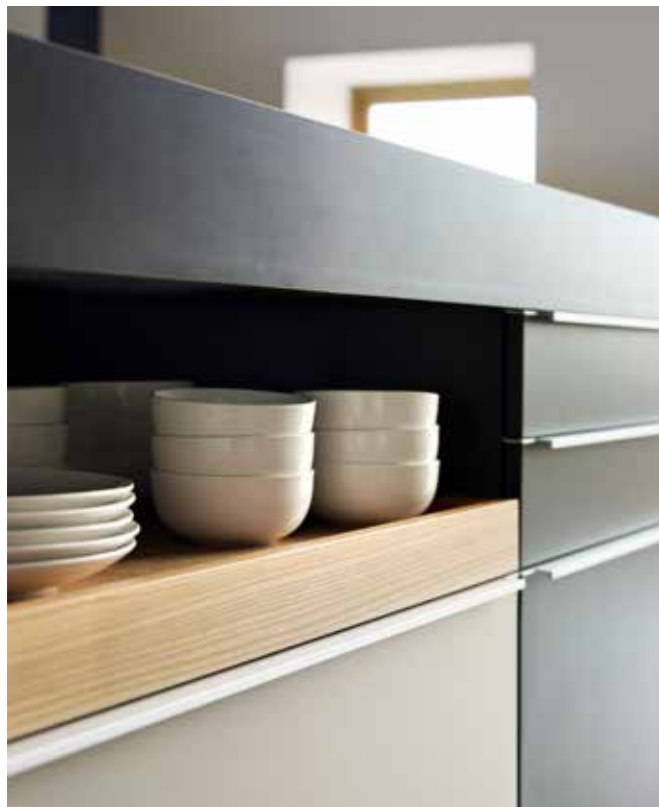
+MODO London, England