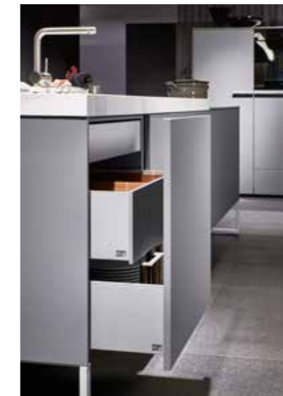
This planning option involves placing a second, thicker worktop directly atop the carcass.