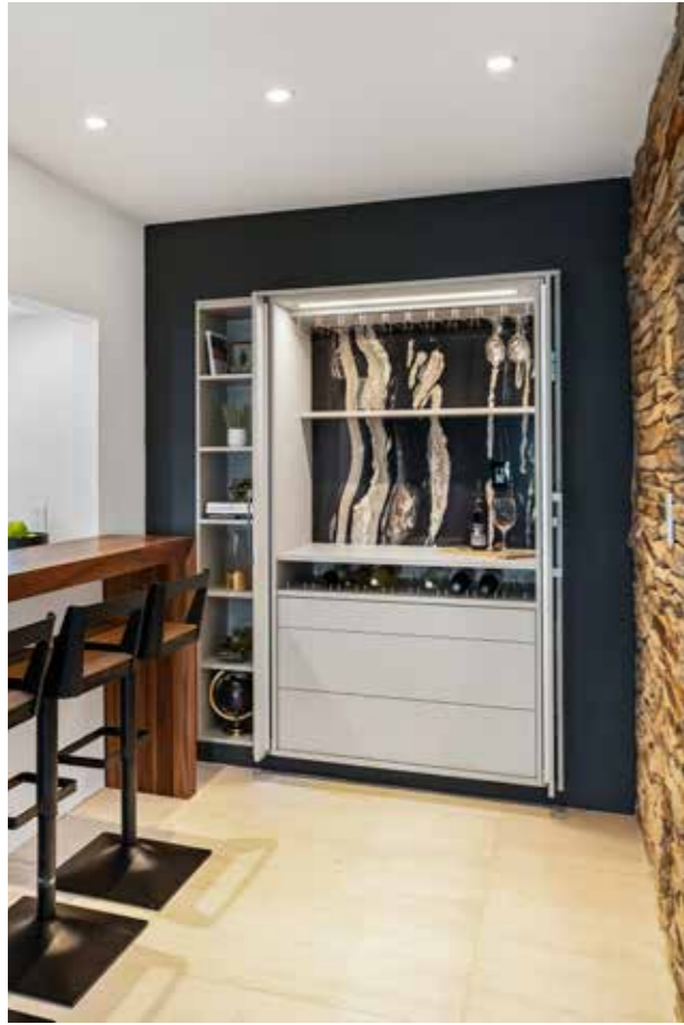
PREMIUM COLLECTION Winter Park, USA